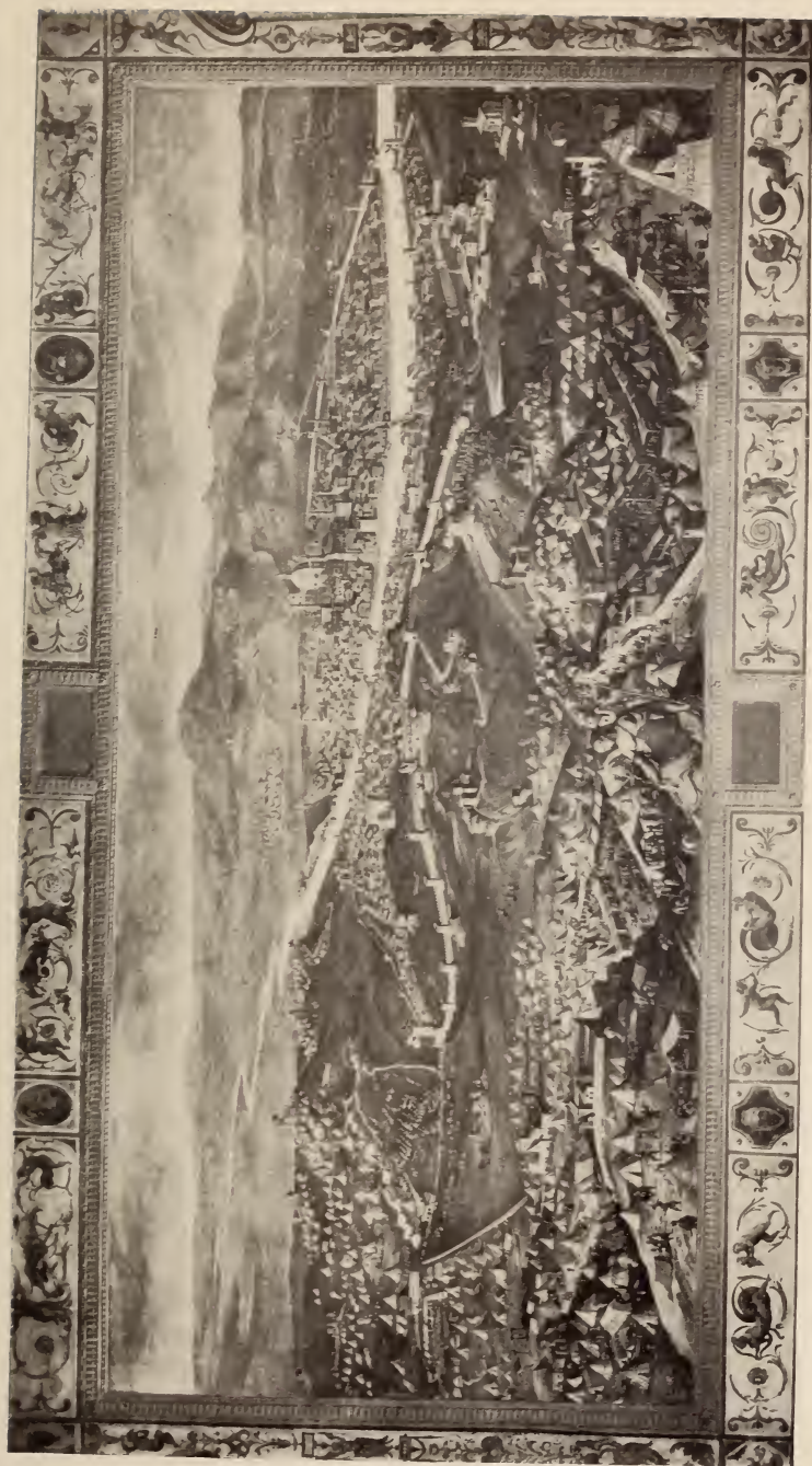
PANORAMA OF FLORENCE IN THE YEAR 1529